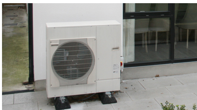
Figure 2: Air Source Heat Pump Outdoor Unit

Ground Source and Water Source: Ground source and water source heat pump systems are less common than air source units. A ground source heat pump system, also known as a geothermal heat pump system, uses the earth as a source of renewable heat. Heat is drawn from the ground through collector pipework and transferred to the heat pump. The ground collector can be laid out horizontally at a shallow depth below the surface or else vertically to a greater depth.